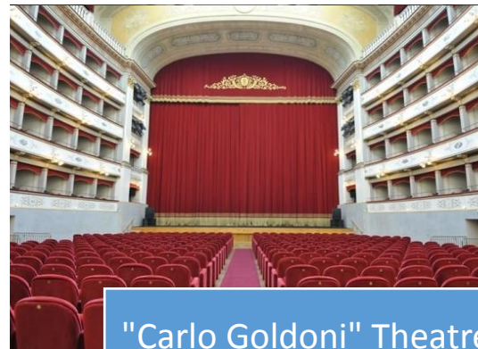
"Carlo Goldoni" Theatre