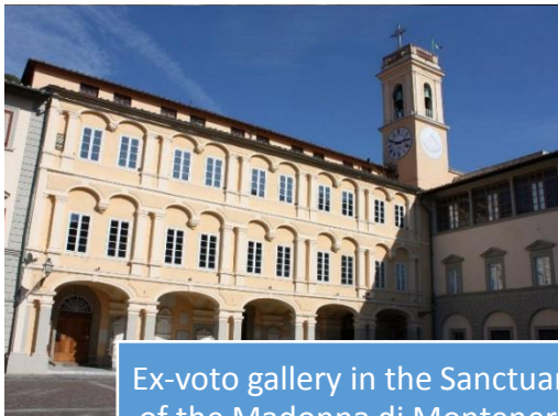
Ex-voto gallery in the Sanctuary of the Madonna di Montenero