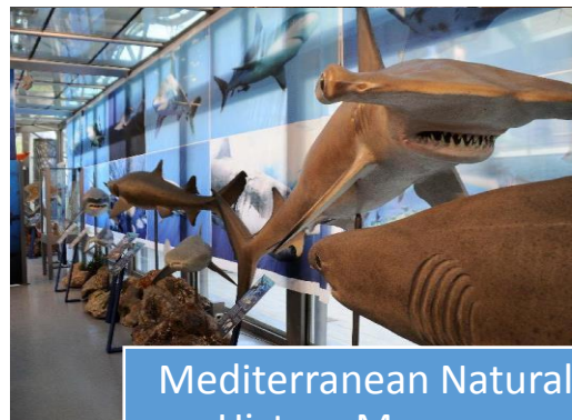
Mediterranean Natural History Museum