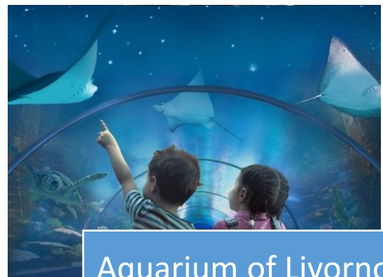
Aquarium of Livorno