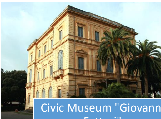
Civic Museum "Giovanni Fattori"